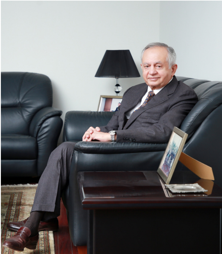
Abdul Razak Dawood - Founder & Chairman BARD Foundation